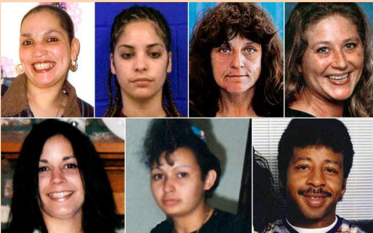
MISSING AND UNIDENTIFIED PERSONS SYSTEM, SEYMOUR POLICE DEPARTMENT